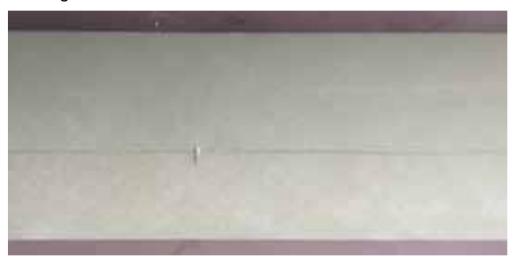
Step 5 - Mark one of the bulkplates as shown.

□ Step 4 - Measure to the middle of the payload tube and drill a single 1/8" hole for a vent hole.